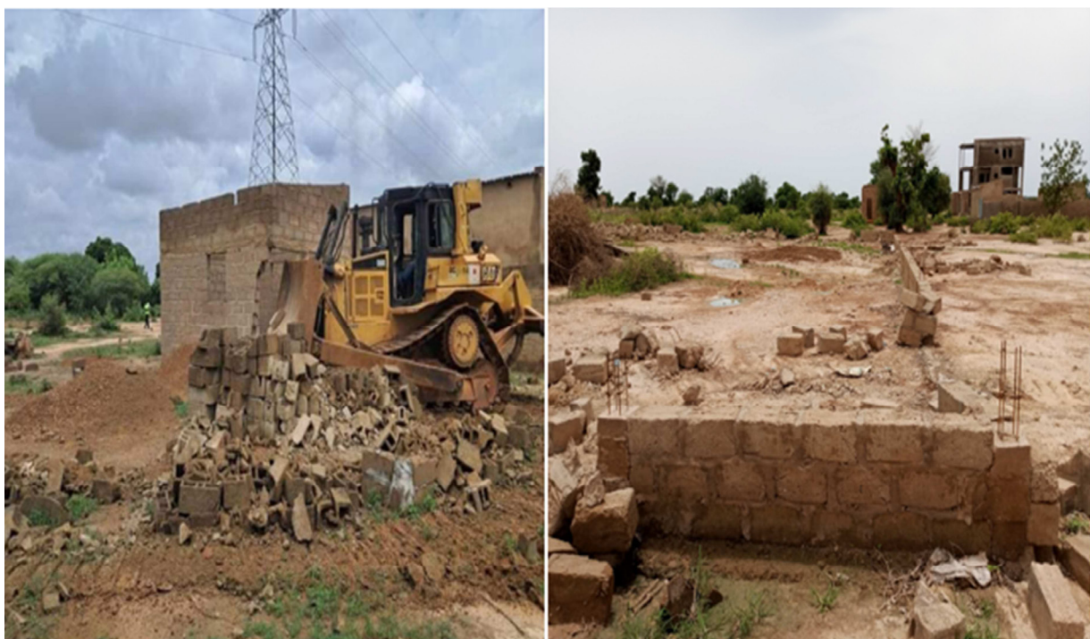
Figure 3. Clearance of illegally developed sites in Komsilga