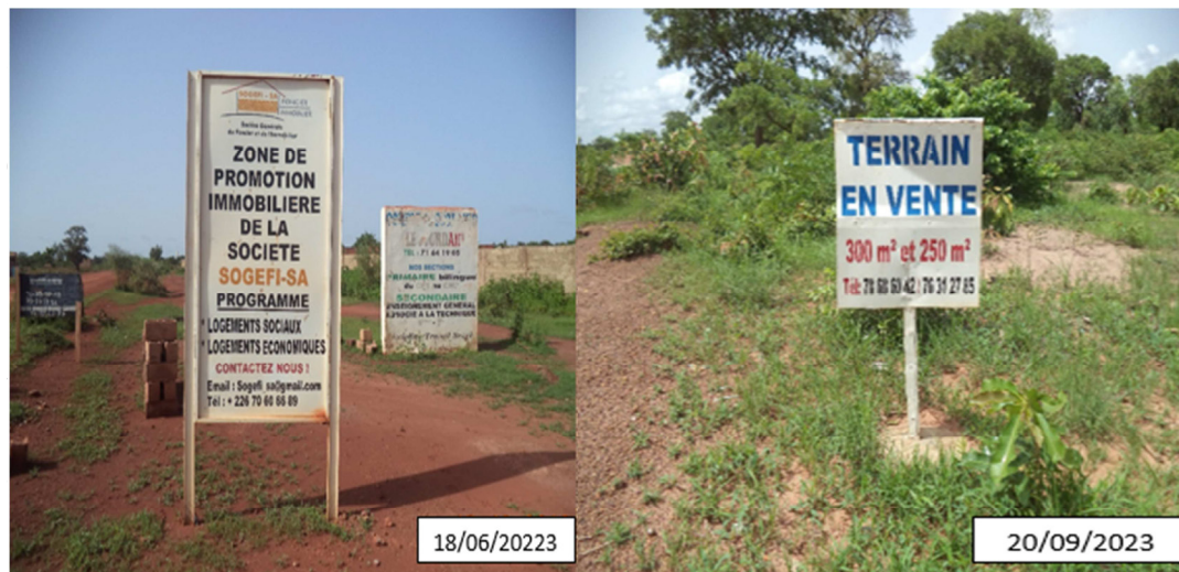
Figure 2. Real estate development zone in the rural municipality of Saaba, photo by the author