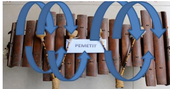
Figure 5. Pattern of the Picker's Xylophone Tones

Gambang Pemetit : o I O o I O A e u a A e u a