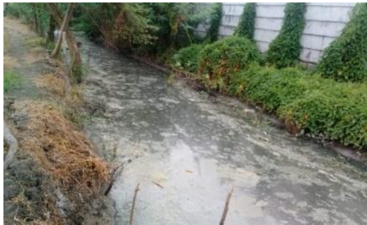
Figure 2. Water Pollution in the Rejosari Village River

Environmental pollution carried out by PT BMI is repeated. In 2018 there was a demonstration carried out by the community as shown in Figure 4.6. The community complained about the pungent smell allegedly caused by waste from PT Menara Internusa (BMI). The community was disturbed by the pungent smell like rotten shrimp. It had been running for three seasons and the pungent smell of rain appeared. However, after there were improvements from the factory, especially the waste treatment, the smell was not bad. But until now the smell is sometimes smelled, especially following the direction of the wind. The people of Rejosari Village have adapted to the environment. This is a consequence that must be taken by the people of Rejosari Village when a factory is established in the Rejosari Village area.