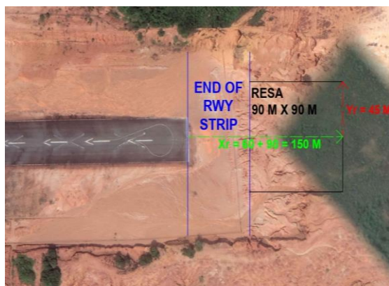
Figure 1. The simulation of Resa 04 Fulfilment at Raja Haji Fisabilillah Airport

The RESA fulfillment simulation aims to determine the difference between using one RESA and two RESAs. SSK II Airport does not apply RESA fulfillment simulation because SSK II Airport in 2022 already has two RESAs at each end of runway strip 18 and runway strip 36. The following is the simulation results.