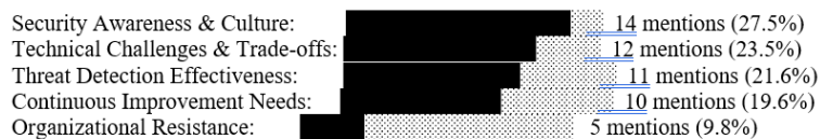
Figure 3. Frequency Distribution of Main Themes from Interview Analysis