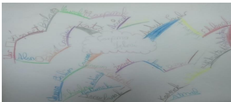
Figure 3. Ö6 student's mind maps related to multiplication

In Table 4, the average of the scores obtained by primary school fourth-grade students from the mind map created for the concept of multiplication ( \bar{x} = 19.64 ) appears to be. The students included concepts related to multiplication, such as division, math, multiplier, multiplication, and summation, that reveal the conceptual aspects of the multiplication operation. It was determined that concepts such as subtraction, school, teacher, lesson revealed by primary school fourth-grade students are not related to multiplication. The concepts of "number, numeral, problem, class, minus, quotient, homework, worry, uneasiness, need, table, book and pencil" related to the multiplication are concepts that are not related to the multiplication operation, which are presented once. Figure 3 shows the mind map prepared by the student coded S6 about multiplication by primary school fourth-grade students.