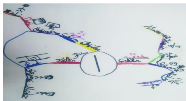
Figure 2. Mind maps related to subtraction of Ö5 student

In Table 3, the average of the scores obtained by primary school fourth-grade students from the mind map created for the concept of subtraction ( \bar{x}=19.64 ) appears to be. The students included concepts that explain the conceptual aspects of subtraction, such as subtrahend, descending, minus, spare, decrease, and summation. It has been determined that concepts such as multiplication, division, school, teacher presented by primary school fourth-grade students are not related to subtraction. Concepts of "lesson, zero, take, result, plus, multiplier, quotient, divisor, numeral, problem, education, math book and smartboard" regarding subtraction are concepts that are not related to the subtraction, which are presented once. The mind map prepared by the Ö5 coded student regarding the subtraction by primary school fourth-grade students is shown in Figure 2.