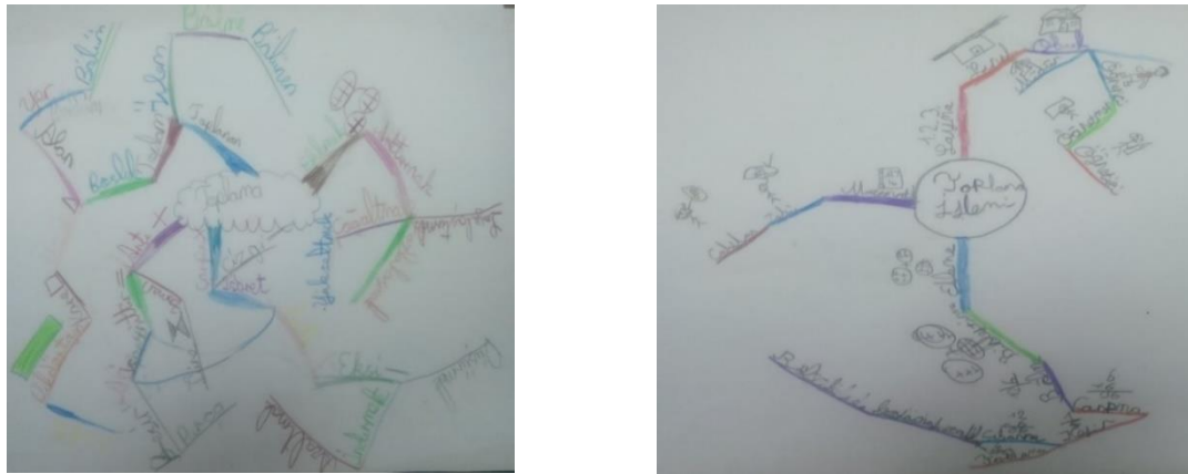
Figure 1. Mind maps of Ö2 and Ö5 students regarding the addition

The scores obtained by primary school fourth-grade students from the mind map they have formed regarding the subtraction and the findings regarding the concepts created are given in Table 3.