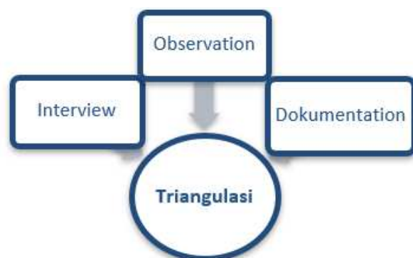
Chart 1. Data Triangulation techniques