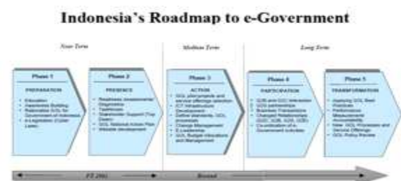
Figure 5. Stages of ICT in Indonesia and Implemented in Nias Regency

ICT stages need to be carried out and examined step by step, when done in a leapfrog manner, it will disrupt the planning that has been made. These leaps will make the results of e-government not perfectly successful and not achieve the indicators set. The stages of ICT or e-government levels are as follows: