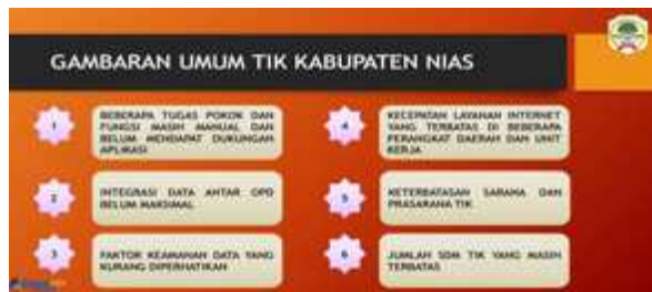
Figure 2. Overview of ICT in Nias Regency

Based on the overview of ICT in Nias Regency above, it can be seen that there are still many tasks and homework for local governments to be able to reach the utilization stage. Cooperation with various stakeholders is common and must be done by other local governments for the implementation of ICT in their regions. The following is a picture of cooperation between stakeholders in the region, namely: