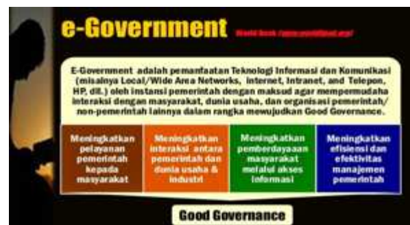
Figure 1. Definition of E-Government

E-government can support more efficient government management and can enhance communication between the government and the community and industry sectors. The public can provide input on policies designed by the government so as to improve government performance, considering that technology can make services transparent, easy and cannot be intervened by any party. The following is an understanding of e-government, namely: