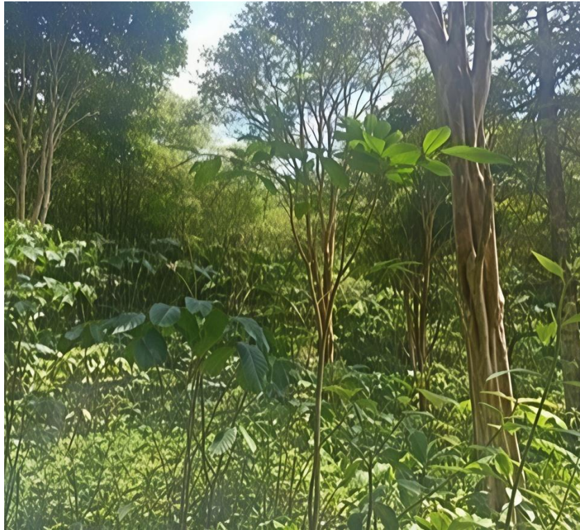
Fig. 7. Lansium domesticum Correa

Lansium domesticum Correa plants have incomplete leaves. The petiole thickens at the base, the shape of the leaves is jorong, the tip of the leaf is tapered. The base of the leaf is blunt, the arrangement of the leaf bones is pinnately bony, the edges of the leaves are incised with flat edges, dark green leaf color, smooth shiny leaf surface, type of gasal pinnate compound leaves with a gasal number of leaflets.