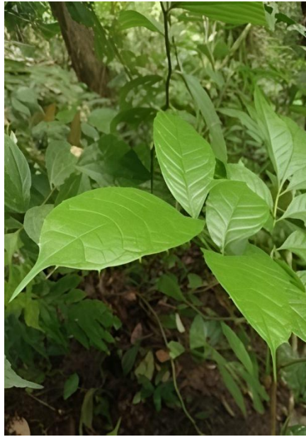
Fig. 5. Walsura pinanta Hassk.