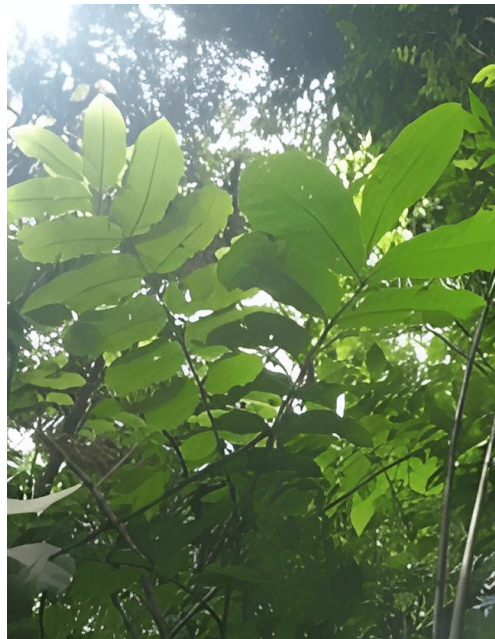
Fig. 6. Dysoxylum Sp1.

This plant has incomplete leaves. The petiole is thickened at the base, the shape of the leaf is jorong, the tip of the leaf is tapered, the base of the leaf is rounded, the arrangement of the leaf bones is pinnately bony, the bones of the branches are united with the leaves. The leaf color is dark green, the leaf surface is smooth and shiny, the leaf type is gasal-pinnate compound with a gasal number of leaflets.