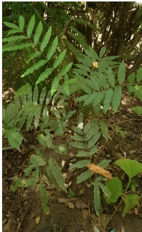
Fig. 3. Aglaia Sp.

This plant has incomplete leaves. The petiole thickens at the base, the leaf shape is lanceolate, and the leaf tip is pointed. The base of the leaf is rounded, the leaf bone arrangement is pinnately bony, the branch bones are united with other branch bones, the edges of the leaves are incised choppy, the leaf color is dark green, the leaf surface is smooth and shiny, the leaf type is basal pinnate compound with a basal number of leaflets.