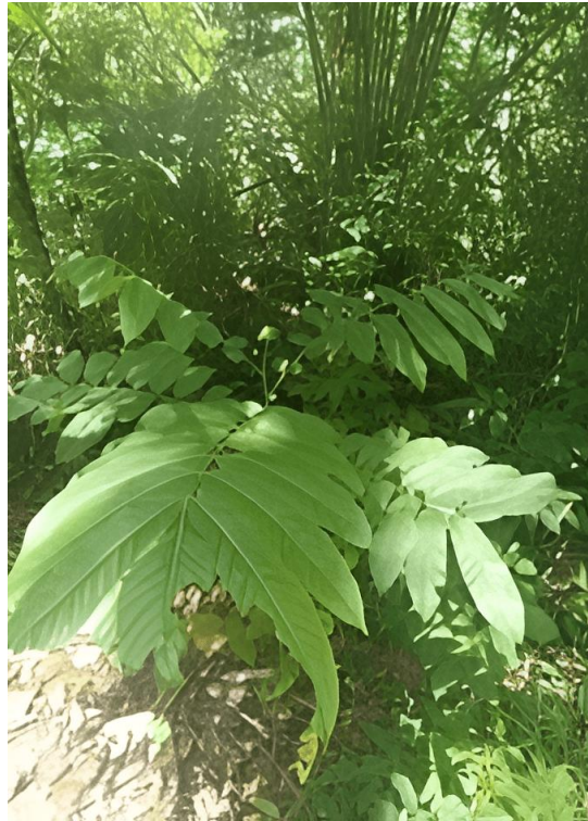
Fig. 4. Didymocheton gaudichaudianus A.juss

This plant has incomplete leaves. Thickened petioles at the base, the shape of the leaf is an inverted ovoid shape and the tip of the leaf is pointed. The base of the leaf is blunt, the bones of the leaf branches are united with the bones of other branches, the edges of the leaves are incised with flat edges, the color of the leaves is yellowish green, the surface of the leaves is smooth and shiny, the type of compound leaves is basal pinnate with a number of basal leaves.