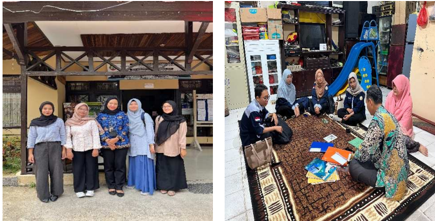
Figure 1. (a) Field observation activities conducted in Kampung Wisata Benua Melayu Laut; (b) Interview activities with members of POKDARWIS during the data collection process.

This statement illustrates that social interaction within the Kapuas Riverbank community is characterised by adaptive and kinship-oriented relationships. Ethnic diversity is not perceived as a social boundary creating separation among groups; rather, it is understood as an inseparable aspect of the multicultural social reality historically formed within riverbank society. Continuous and sustained social interaction strengthens social cohesion and contributes to the development of harmonious interethnic relations among community members. Findings from field observations and interviews are presented in Figure 1.