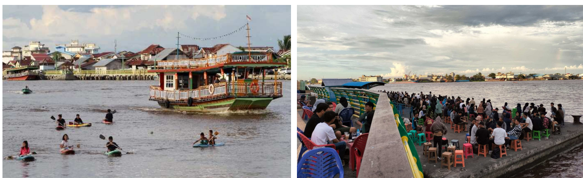
Figure 2. Kapuas River as a shared socio-cultural space supporting social interaction and intercultural communication among multiethnic communities in Pontianak City.

Beyond shaping social relations among residents, the Kapuas River also functions as an important socio-cultural space influencing communication patterns and community activities within Pontianak's multicultural society. Economic activities such as traditional trading, river tourism, and water transportation create high levels of social encounter within the riverbank environment. Observational findings indicated that residents from various ethnic groups utilise the same communal spaces without demonstrating rigid social segregation in their daily activities. Such naturally occurring interaction patterns facilitate more open and inclusive intercultural communication among communities. In this context, the Kapuas River serves not only as a geographical and economic resource but also as a shared social environment connecting multiple cultural identities within Pontianak society. The river's presence as a communal living space contributes significantly to the construction of collective identity among Kapuas Riverbank communities as a multicultural society characterised by relatively harmonious social relationships.