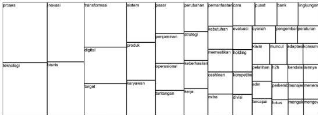
Figure 2 Tree Map

strategy, PT. Jamkrindo Syariah shows its commitment to remain relevant and competitive in the sharia insurance industry.