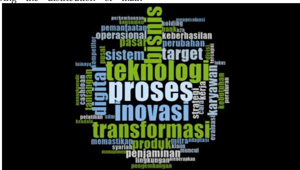
Figure 1 Word Cloud

themes or categories along with sub-themes based on frequency proportions, thus helping to understand the structure of the data in an organized manner. Meanwhile, Cluster Analysis identifies groups or relationships between themes based on pattern similarities, providing an in-depth perspective on how certain concepts are interrelated in the data. These three results together provide a foundation for more focused and evidence-based data interpretation. The output results of Nvivo 12 include: