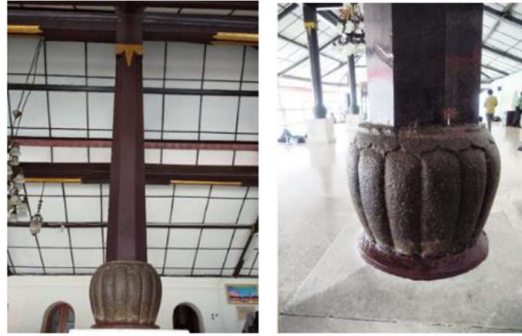
Figure 2. The symbolic representation of pumpkin in traditional Islamic Architecture in Masjid Agung Banten, Indonesia [Source: 55]. Pumpkin in the Javanese traditional language is ' waluh ', which is almost the same as ' Wallah ', an Arabic word that means; 'for Allah'.

Furthermore, in the contemporary era, architects may use the Islamization technique to combine traditional Islamic and contemporary knowledge [50]. Meanwhile, builders have the opportunity to explore and adapt the possibilities offered by the machine age, much like craftsmen of the past explored the intricacies of geometrical and arabesque patterns [73]. The choice of approach is flexible and should be guided by local conditions, opting for the method that is more readily accepted and provides a greater value for both the society and Islam as a religion. This adaptability ensures that Islamic architecture remains relevant, responsive, and meaningful in diverse contexts.