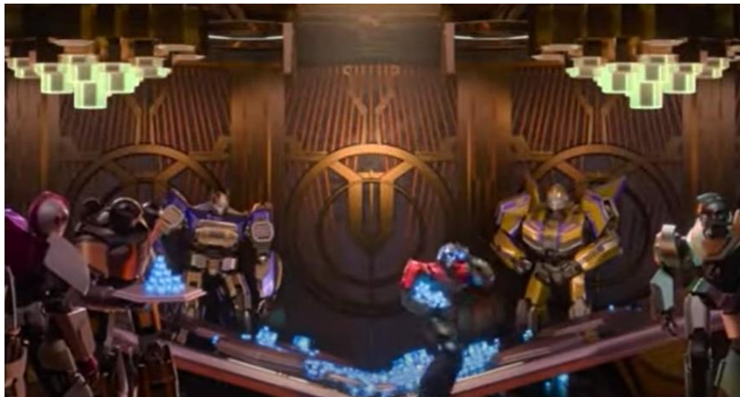
Figure 3. Data 2 Orion Pax Expressive speech act.

The expression of Orion Pax in the dialogue showed complaint expressive speech act, in pragmatic function complaint is frustrated with how one behavior or statement gives dissatisfaction to the speaker (see Figure 3).