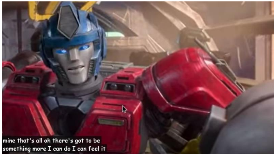
Figure 7. Data 5 Orion Pax Expressive speech act

Based on the data collected from several researcher sequence and dialogues as well as those of other supporting characters, this analysis showed that Isabella had to make two decisions she did not want to make, which caused her to go through an internal conflict. She is therefore compelled to employ self-defence mechanism in order to survive in unsafe conditions.