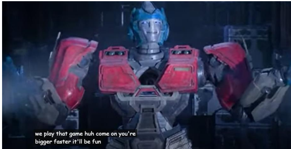
Figure 5. Data 5 Orion Pax Expressive speech act