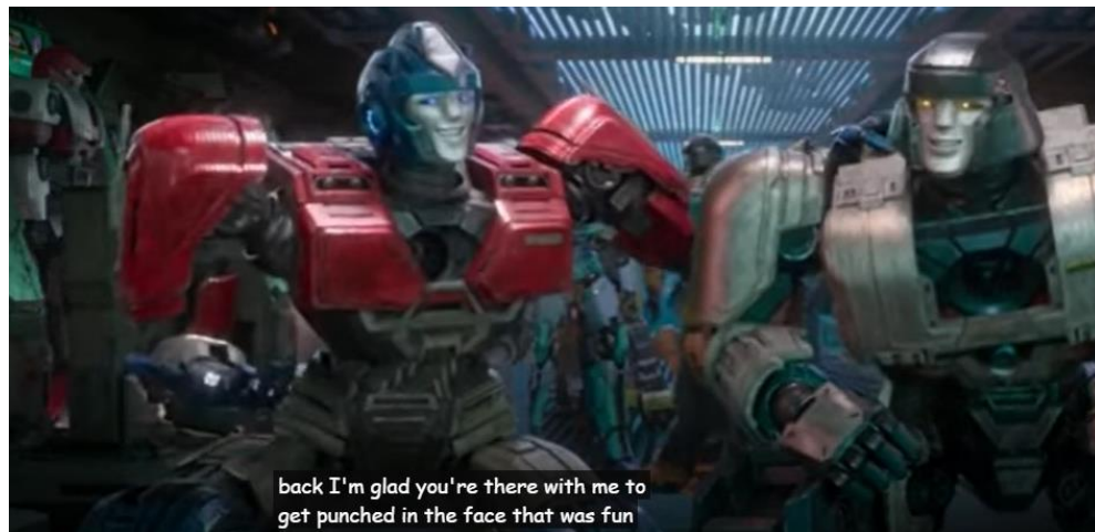
Figure 1. Data 1 Orion pax expressive speech act.

The dialogues is identified showing Orion Pax emotions of gratitude, which is expressing appreciation for maintaining social harmony by acknowledging the contributions of others and minimizing potential conflicts (see Figure 1).