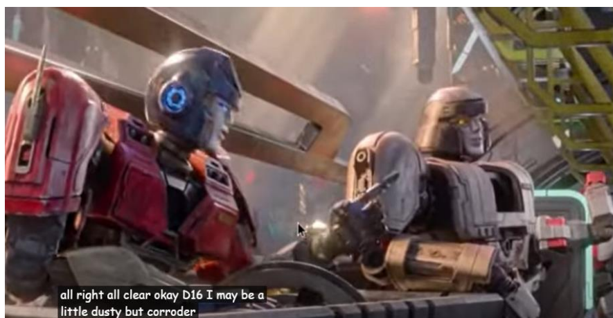
Figure 2. Data 2 Orion Pax Expressive speech act.

The dialogues is identified showing Orion Pax emotions of gratitude, which is expressing appreciation for maintaining social harmony by acknowledging the contributions of others and minimizing potential conflicts (see Figure 2).