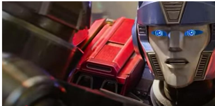
Figure 4. Data 4 Orion Pax Expressive speech act.

The dialogue of Orion Pax in here showed an apology emotion after falling into random room or restaurant of the robots which is energon for their foods, an apology is expressing politeness in a way of respecting others reflects self-action (see Figure 4).