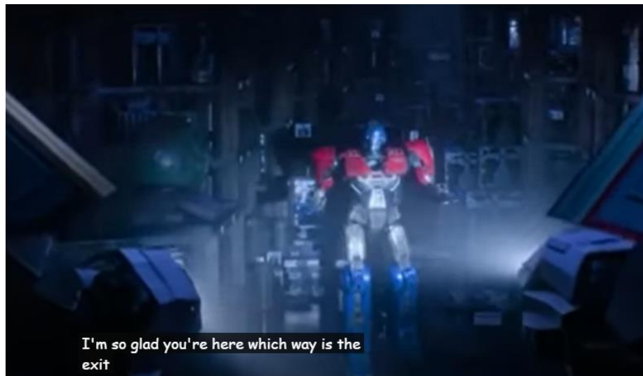
Figure 6. Data 6 Orion Pax Expressive speech act

Data dialogue presenting Orion Pax as he gets cornered creating atmosphere to calm the guards down this type of expressive speech act is praising, because praising is here creates a supporting atmosphere to make interactions more pleasant and respecting higher class (see Figure 6).