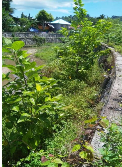
Figure 4 The flooded area where the embankment has been built