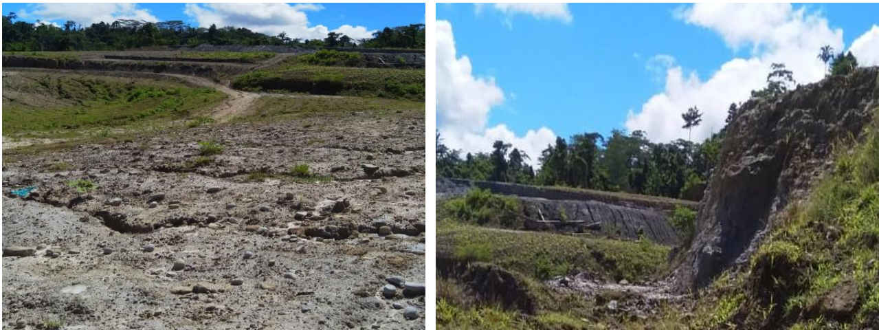
Figure 5 The planned upstream watershed for the built-up area has been partially leveled (left). Some of the lands is still steep and made like a ladder (right)