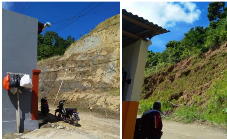
Figure 3 Ingramui Village settlement adjacent to a steep hill without vegetation (left), a residential area adjacent to a steep hill with vegetation (right)

According to Oktivova and Rudiarto (2019), the community began to change their behavior in land use in the suburbs from non-built land to built-up land. Furthermore, the steep slopes (25 - 40%) covering an area of 1,366.91 hectares (58.47%) of the Wosi watershed area include the villages of Udopi, Ingramui, and Soribo, with slopes ranging from flat to very steep at an altitude of 0 – 1,450 m from sea level. The steeper the slope, the greater the runoff velocity if the area is less vegetation. Mahmud et al. (2021b) argue that land use for settlements/built-up areas has higher runoff and sediment than forest areas. The results of the survey of areas located on steep slopes that were previously plantations and forest areas began to be converted to settlements (Figure 3).