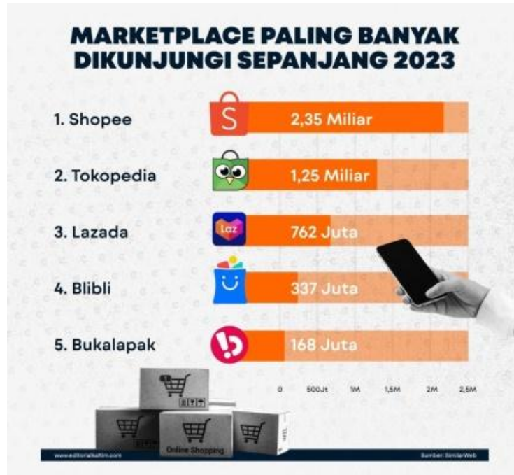
Figure 1. Marketplace mostvisits

Based on SimilarWeb data, shopee is an e-commerce marketplace category that has the most site visits in Indonesia throughout 2023.