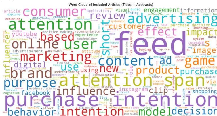
Figure 2. The Word Cloud of Included Articles

Color psychology has been shown to evoke emotional responses and influence consumer behavior. Bright, high-contrast color schemes, for instance, can trigger excitement and urgency, prompting users to explore or interact further (Labrecque & Milne, 2013). For Gen Z, who are often exposed to visually saturated environments, bold yet balanced color palettes improve recall and encourage faster recognition of brand messaging (Eckler & Bolls, 2011).