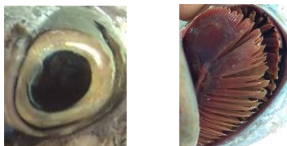
Figure 3. image of the eyes and gills

The research data used as data on the freshness level of cob fish is in the eyes and gills of fish, amounting to 80 data on cob fish's eyes and gills—examples of digital imagery of fish eyes and gills on Figure 3.