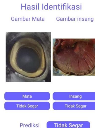
Figure 4. Examples of System Test Results

The freshness detection process results such as Figure 4 of the eye and gill processes of cob fish were successfully processed and obtained an image comparison that is most similar to that to be tested. Describe in the form of a type of freshness of fish displayed on the bottom right, while for the image of gills located on the bottom left is a picture of gills that have been trained.