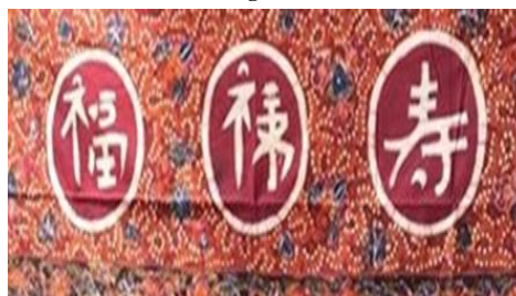
Visualization Fu Lu Shou motif Batik Tokwi Sekarkencana 1