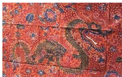
Visualization of the Dragon motif of Tokwi Sekarkencana Batik 1