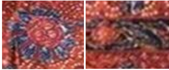
Visualization of the Truntum Flower in the Tokwi Lasem Sekarkencana Motif 1

Meanwhile, the truntum flower ornament is present in the Tokwi Sekarkencana 1 motif. It is not without meaning, the truntum flower is present in the Tokwi Sekarkencana 1 motif, symbolizing happiness. The truntum flower that is present in the visualization of the Tokwi Sekarkencana 1 motif is a top view, there are also some that are side views or bottom view visualizations. In Tokwi Sekarkencana 1, the truntum flower is present with red and blue visualizations. Sigit Wicaksono in an interview said: