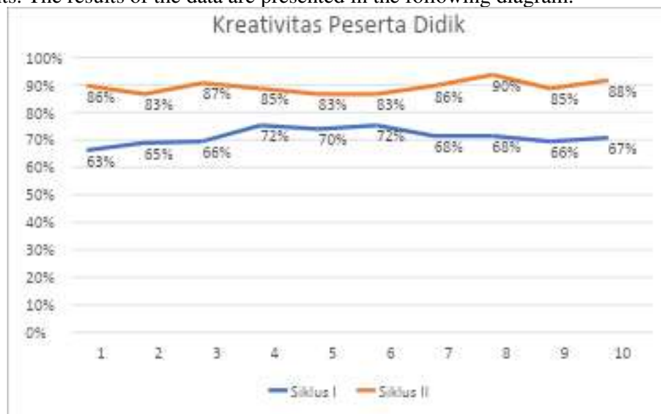
Figure 4. Percentage of Student Creativity Results

a questionnaire was distributed that had been prepared and would be filled in by 31 students. The results of the data are presented in the following diagram.