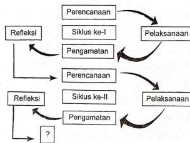
Figure 1. Classroom Action Research Design

This study uses the type of Classroom Action Research (CAR). Classroom Action Research is classified as quantitative and qualitative research. Classroom Action Research is different from descriptive research or experimental research. In descriptive research, what is described is the object at the time of the research, while experimental research is described regarding the cause and effect after a treatment. The research was carried out in two learning cycles, if the action is still not good, an evaluation will be carried out and carried out in the next cycle. Therefore, the research can be continued to cycle II by planning appropriate improvements, so that the research results obtained are better, as described as follows (Arikunto, 2019)