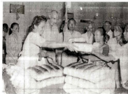
Figure 4. Distribution of bread rations to refugees

Efforts to address displacement were carried out through a combination of government policies and solidarity from the Chinese community itself. Archives from the Indonesian Ministry of Information (1948) record that around 1,200 Chinese refugees in Central Java received logistical assistance in the form of rice, cloth, and medicine through coordination between the Indonesian National Committee (KNI) and the Indonesian Red Cross (PMI). In Yogyakarta, the Chung Hua Tsung Hui organization set up an emergency command post that provided temporary shelter for refugee families (Soni & Setiawati, 2017).