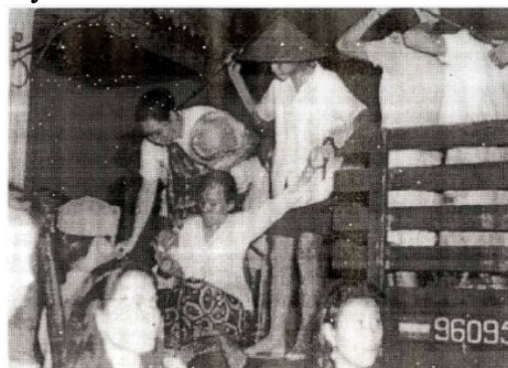
Figure 1. Evacuation of Chinese People to the Chung Hua Tsung Hui Building

The data in Table 2 shows that the Cirebon region was one of the most densely populated areas receiving refugees in 1947. This pattern indicates that the migration of ethnic Chinese took place in stages and in an organized manner, following relatively stable administrative and military security routes. The city of Cirebon served as a major transit center, where refugees were gathered before being transferred to other safe cities such as Semarang, Yogyakarta, and Surabaya. Most refugees arrived in groups by truck or on foot in long convoys escorted by Republic soldiers and community volunteers. This phenomenon marked the formation of a semi-formal refugee pattern that combined community initiatives with the support of non-state institutions, indicating that the management of social disasters during the revolution was driven more by the community than by state authorities.