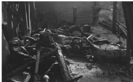
Figure 2. Condition of the food preservation factory in the warehouse where the bodies of Chinese victims of violence were burned.

In Yogyakarta, Theonia (2023) found that violence against the Chinese led to suspicion of the Republic's government, which was considered to have failed to protect non-native civilians. This situation deepened the social divide between the Chinese community and the local community, who had previously lived side by side. To visually illustrate the impact of violence experienced by ethnic Chinese communities during the revolution, the following archival photographs document the condition of factory buildings destroyed by mass attacks and arson in Malang.