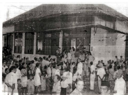
Figure 3. Evacuation of Chinese People at the Chung Hua Tsung Hui Building

One concrete example of this social dislocation can be seen in the evacuation of refugees to the Chung Hua Tsung Hui Building in Cirebon in 1947. The building became a shelter for hundreds of Chinese families who fled Kudus, Rembang, and Ciledug after waves of violence and house burnings spread. The Chung Hua Tsung Hui organization, which was originally a social and cultural association, transformed into an emergency humanitarian agency that sheltered and assisted refugees amid political and military turmoil.