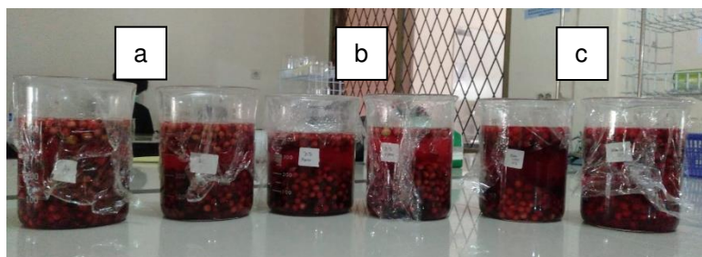
Figure 2. Extraction process of Buni (a) distilled water, (b) ethanol 70%, (c) citric acid

low pH (1-3). Anthocyanins in Buni are natural pigments influenced by the presence of light, oxygen, enzymes, proteins, and metal ions (Rein 2005). This phenomenon shows the extraction of anthocyanins from Buni occurred in the three solvents. Compounds of the flavonoid group such as anthocyanins are polar compounds and can be extracted with polar solvents. (Harborne & Mabry 2013).