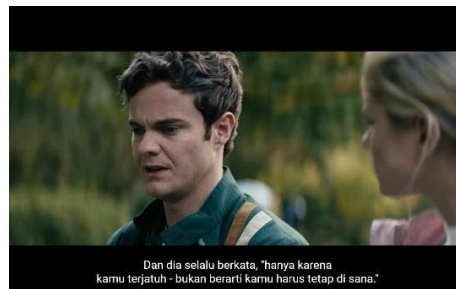
Figure 1.4 Scene where Hughie shows empathy and support for individual team members

Annie: "You know how you have this image of yourself? Like, I thought I was strong, you know? Like made of steel, a fighter, and then I'm faced with a horrible situation. And I just hear my mom's voice in my head, keep laughing the show must go on. And I didn't fight back, and now I just feel sick. But mostly because it turns out I'm not who I thought I was. Oh, I'm sorry, I didn't mean to leave all that to you"