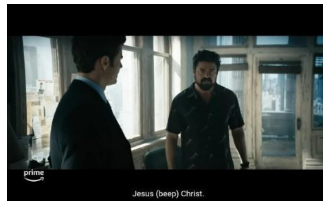
Figure 1.1 Shows Hughie sticking to his moral principles even under pressure or disagreement with Billy Butcher.

Hughie: "Butcher, it's been a year. You can stop all this. It's okay to stop, to move on. She would want you too"