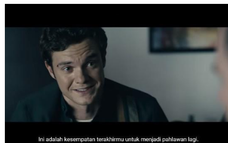
Figure 1.2 Shows Hughie talking about the importance of struggle to his colleagues and also motivating his colleagues to keep fighting.

Hughie Campbell: "Look, Vought ruined you, didn't he? This is your last chance to be a hero again. They did the same to him (Starlight)"