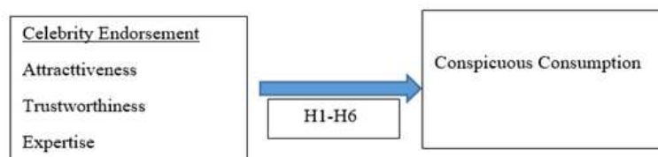
Figure 1. Research Model