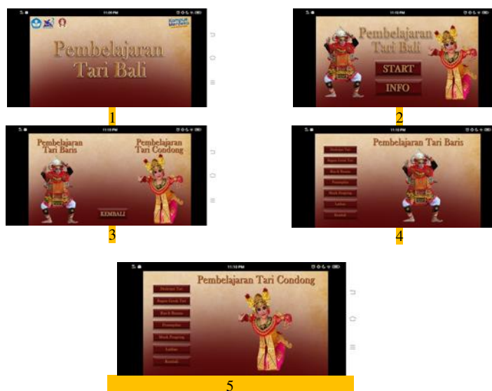
Figure 1. Display of learning media on android

Android Application Development Process with Software Constructs 2. Some of the pages on the Android-based learning media application have been created.