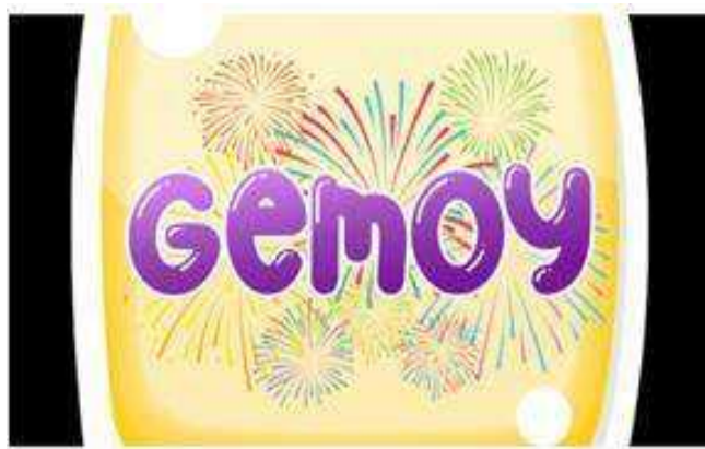
Figure 2. Main Cover GEMOY

The result of media validation shows the game features both educational materials and interactive game sessions. The six levels of the game are designed to progressively build literacy skills: Levels 1 and 2 focus on vocabulary, levels 3 and 4 on language structure, and levels 5 and 6 on reading comprehension. To start the game, the students will meet the main cover as shown in Figure 2: