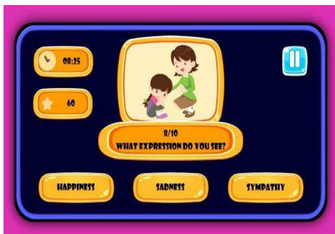
Figure 4. GEMOY level 1 display menu

To start the game, they are presented with a choice of levels, as illustrated in Figure 4. This allows learners to select an appropriate level based on their proficiency and preferences, ensuring a personalized gaming experience.