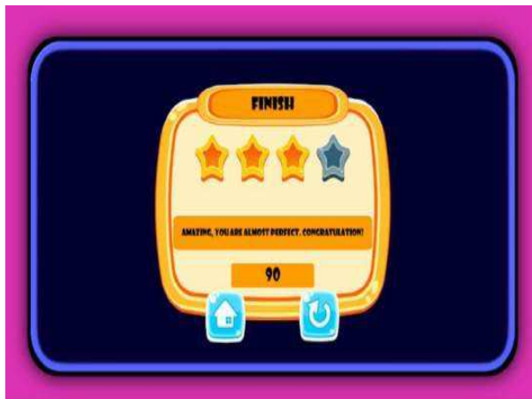
Figure 5. GEMOY reward for finishing the game level