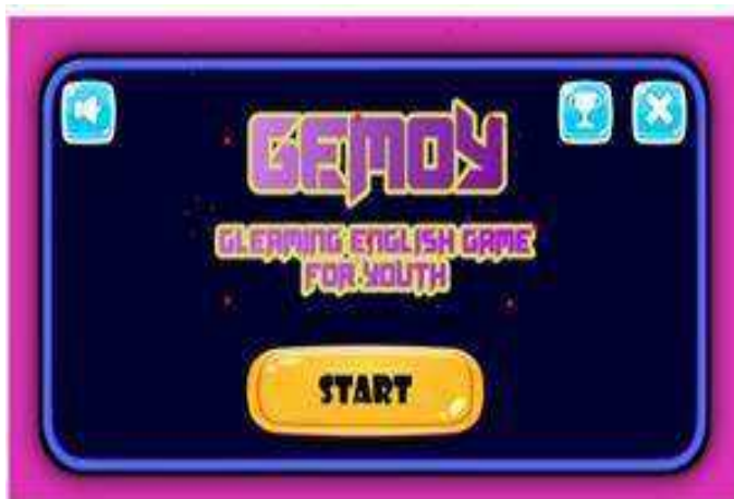
Figure 3. Start Button

To start the game, they are presented with a choice of levels, as illustrated in Figure 4. This allows learners to select an appropriate level based on their proficiency and preferences, ensuring a personalized gaming experience.