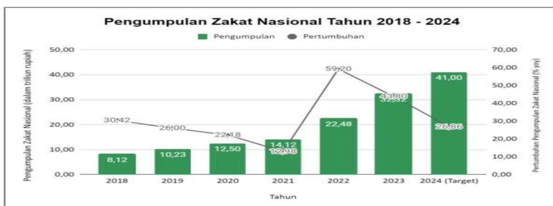
Figure 1. Growth of ZIS Collection

The Al-Azhar Zakat Institution (LAZ) is one of the institutions that manages Zakat, Infaq, and Sedekah (ZIS) funds and plays a vital role in distributing funds to those in need. However, in recent years, LAZ Al-Azhar has faced significant challenges related to declining donor participation rates and slowing growth in ZIS fundraising. Data from the National Zakat Agency (BAZNAS) shows that the potential for ZIS funds in Indonesia reaches IDR 237 trillion, but the realization of collection is still far below this potential, which is around IDR 41 trillion in the period 2018 to 2024. In addition, the growth rate of ZIS fund collection decreased from 43.80% in 2023 to 26.86% in 2024, which indicates the need for a more effective communication strategy to overcome this challenge.