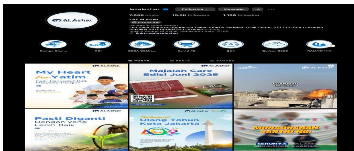
Figure 2, LAZ Al Azhar Instagram