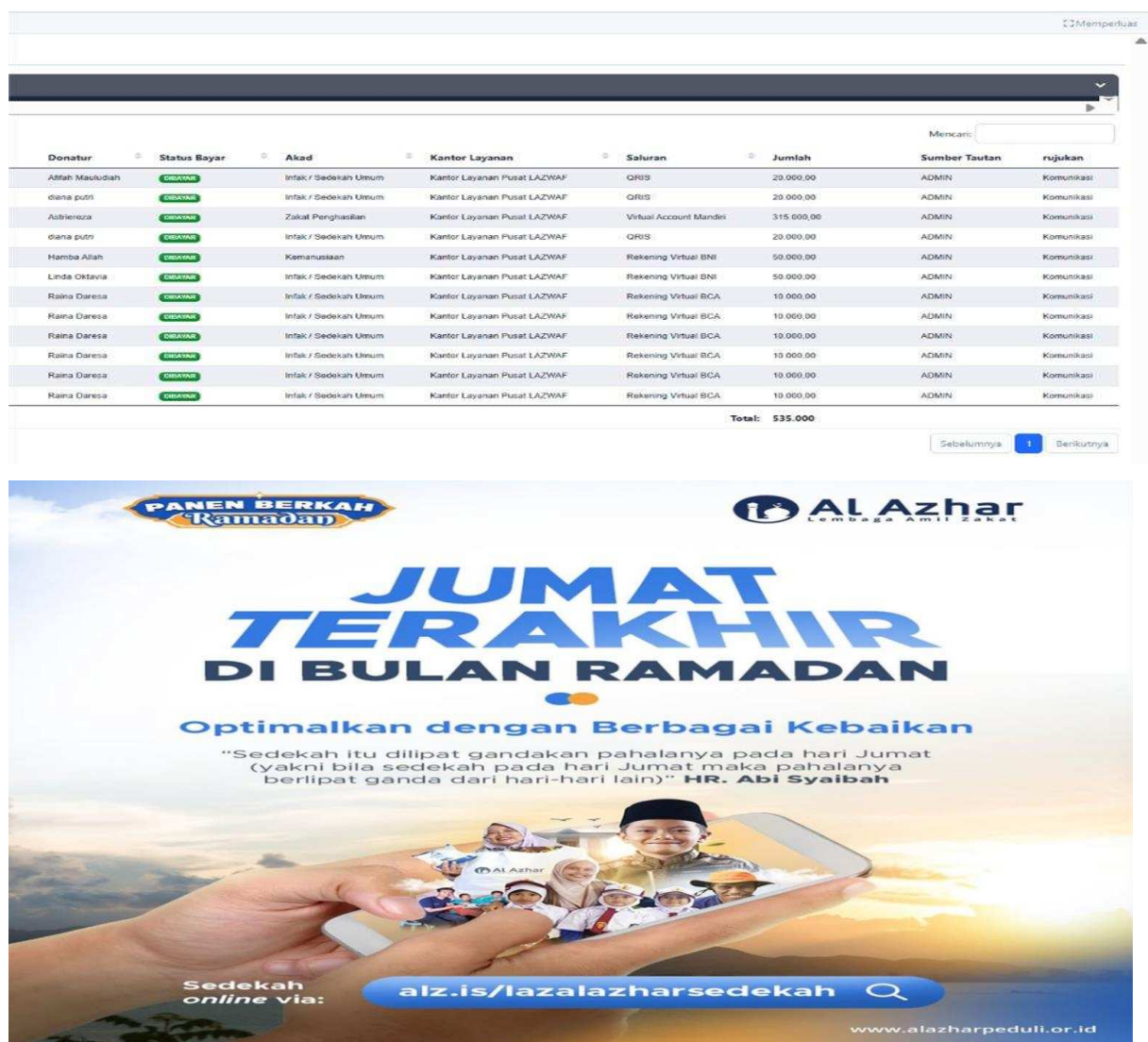
Figure 4. Exposure to Ramadan content in donation drives

Education about the obligation of zakat, presented in a visual and interactive format, also helps donors understand the calculation and benefits of zakat more clearly. This increases their awareness and commitment to fulfilling this obligation regularly.