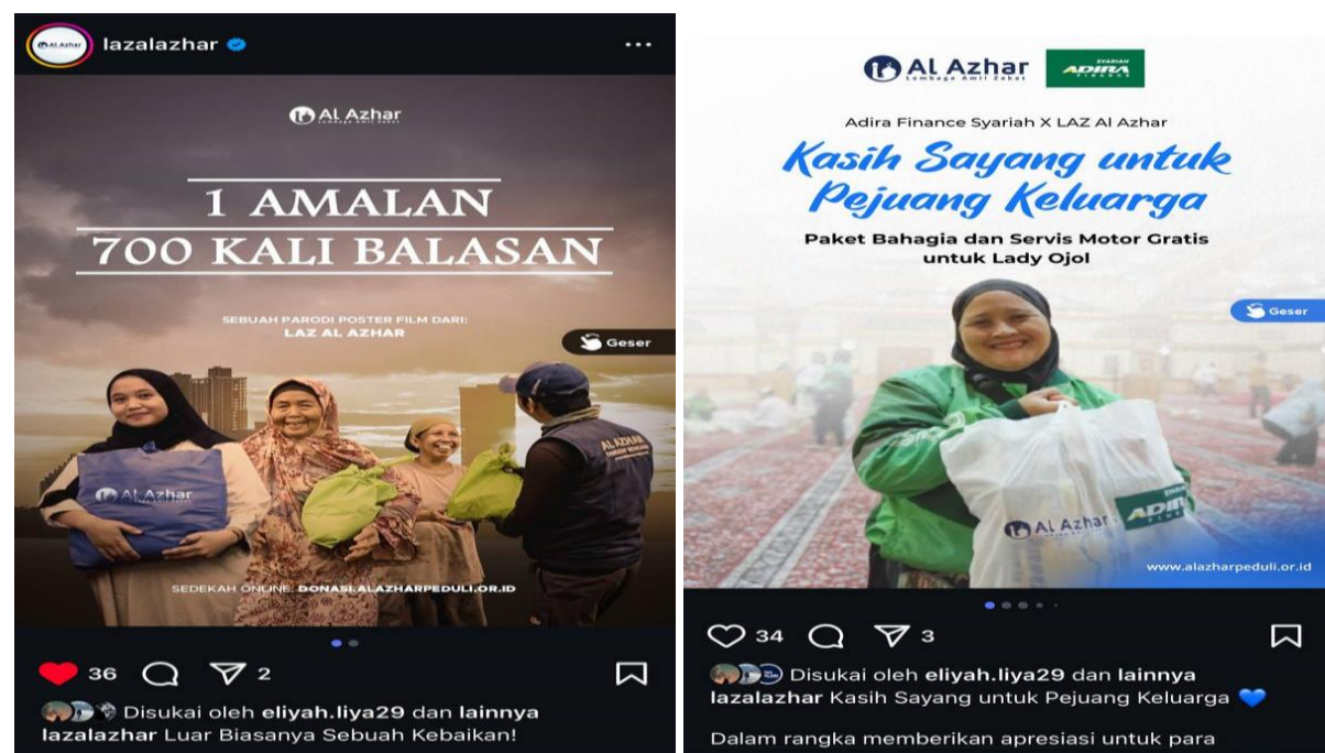
Figure 5. Soft-selling message inviting LAZ Al Azhar's Instagram audience to engage

Furthermore, soft-selling techniques are used in conveying donation messages. Rather than explicitly inviting donations, the content emphasizes building awareness and empathy first, so that the audience feels compelled to voluntarily participate. This approach is also supported by utilizing social and religious moments, such as Ramadan, Islamic holidays, and payday, which psychologically increase donors' readiness and motivation to contribute.