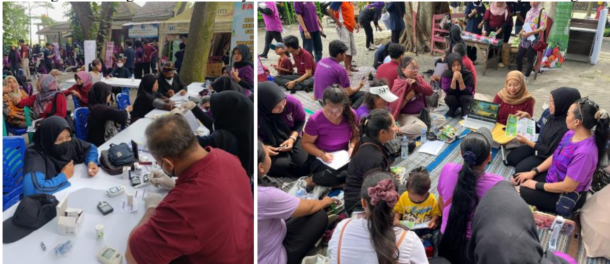
Figure 1. Documentation of community health promotion activities, including health education sessions, screening of vital signs and anthropometry, biochemical examinations, and preventive interventions conducted in Rejomulyo Village, Kediri.