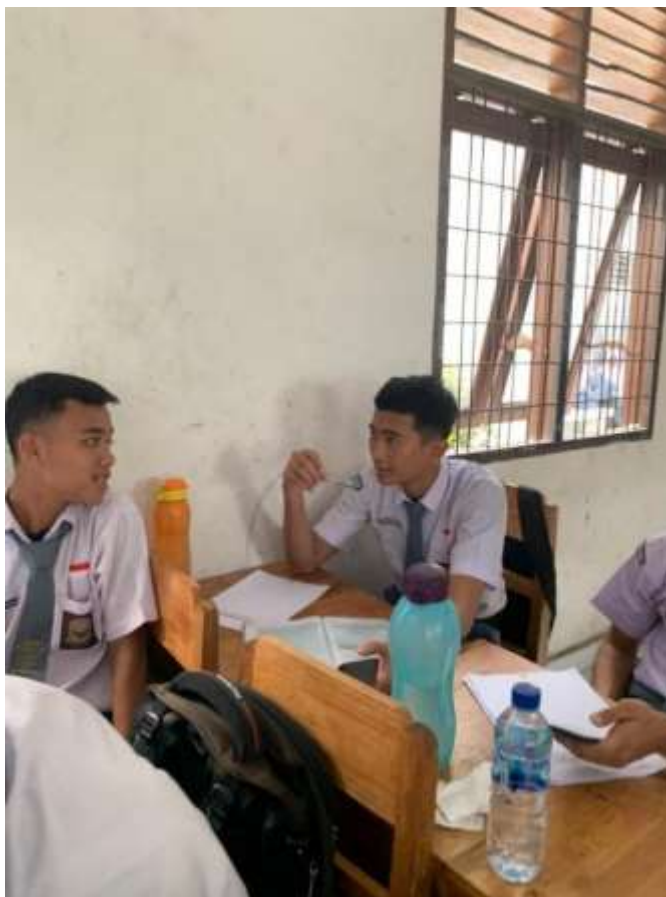
Figure 3. Learning Argumentation Paragraphs

with more spotlight on the material of composing contentious papers. Analysts found a way multiple ways to get information that met the measures for composing contentions. The primary gathering of analysts gave fundamental material connected with composing contentions and was held for 3 x 45 minutes. Specialists center around understanding pugnacious and functional texts straightforwardly.