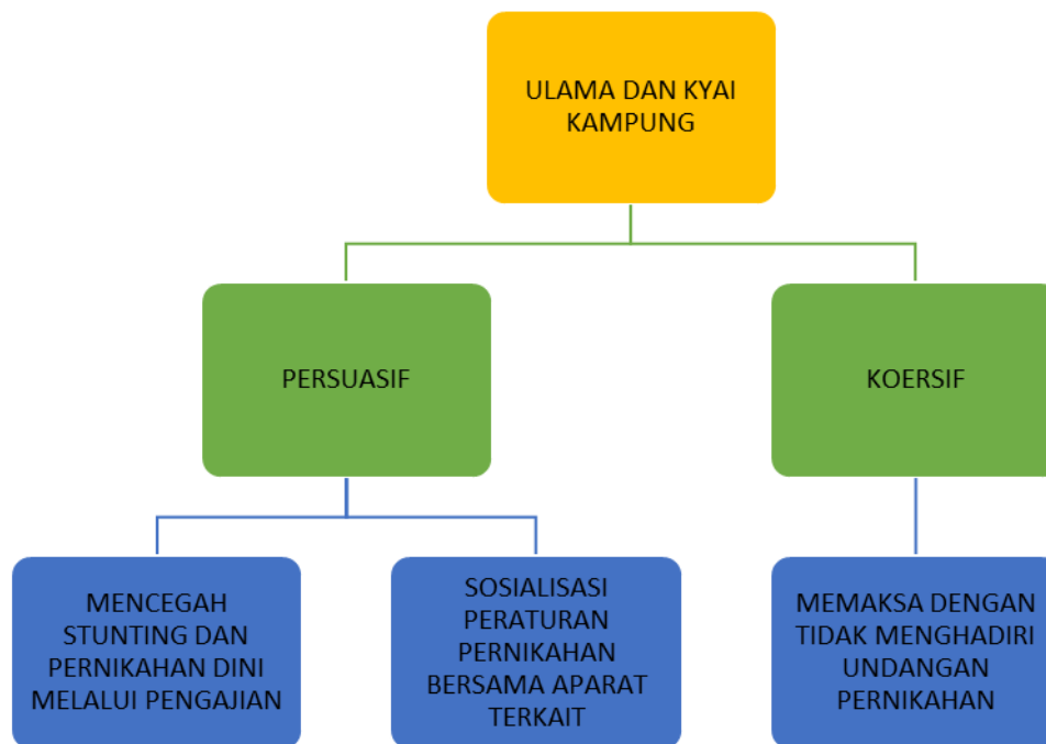
Diagram 3. Symbolic Capital of Scholars in Stunting Prevention Through Early Marriage

The culture of early marriage in society has the opportunity to be changed, although it is difficult and requires a continuous process and integration of all parties, in this case through the optimization of the role of symbolic capital of kyai and ulama, because they are role models and have a great influence on society. In the momentum of the wedding, the community will always consult with the Village Kyai and Ulama regarding the implementation time, which is a 'good' day to hold the wedding. Marriage is considered sacred, so not everyone knows the rules of its implementation, if it is wrong in determining a 'good' day, it will have implications for health, safety, smooth risk, and others. Thus, we can understand that the role of the village kyai, the religious scholars in the village, is very significant in preventing the practice of early marriage.