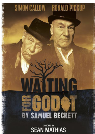
Figure 4. Poster Waiting for Godot

This tree is in fact the main breath of the show. It depicts a regeneration that is full of hope and growth, yet empty and lonely. It also depicts the loneliness and meaninglessness felt by Vladimir and Estragon, and has led to many interpretations from readers (or viewers) of Waiting for Godot . Some relate it to the cross and Jesus, others to the Khuldi fruit tree in heaven. Some interpret it through the perspectives of absurdism, atheism, and existentialism. The tree has become the icon of Waiting for Godot , which makes anyone who remembers the show remember the tree. On the other hand, when you see a tree standing alone on the ground after a disaster or war, you will immediately think of Waiting for Godot .