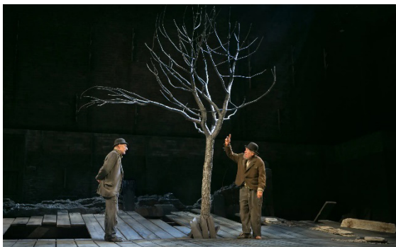
Figure 3. Ian McKellen and Patrick Stewart play Waiting for Godot.

The tree in the work is one of the things that Beckett maximizes. Even in the latest performance of Waiting for Godot , which stars the best actors such as Ian McKellen and Patrick Stewart, as well as a stage director of the same caliber as Sean Mathias, the tree is still the most highlighted thing. You can see the poster and photos of the show below.