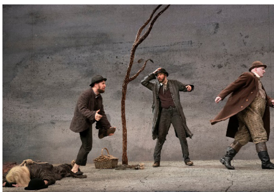
Figure 2. Staging Samuel Beckett's Waiting for Godot by Shakespeare Theatre.