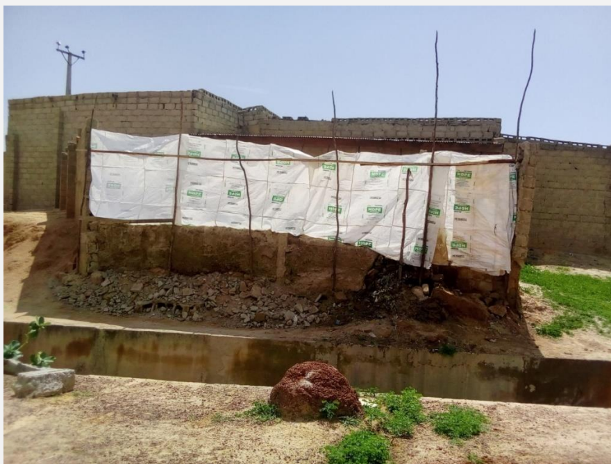
Figure 3. A house close to Ginzo stream whose wall collapsed during flood incidence in Katsina metropolitan