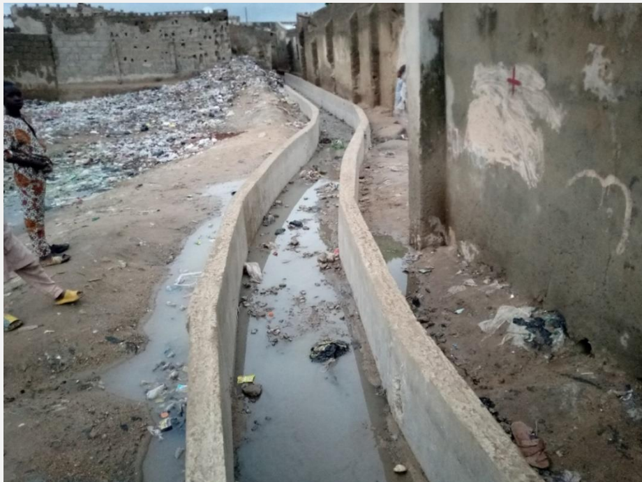
Figure 4. One of the storm water drainage projects through houses at Shararrar pipes in Katsina town

Several types of diseases have spread as a result of the flood incidences in Katsina state. One of the most common types are diseases associated with the creation of stagnant water bodies such as puddles where vectors such as mosquitoes can easily breed to spread malaria fever. Okaka & Odhiambo (2018)