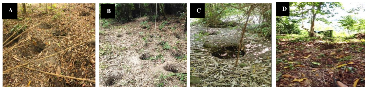
Figure 1 (A) Beringin nesting ground, (B) Halbolo nesting ground, (C) Alang-alang nesting ground, and (D) Pinanggobolu nesting ground