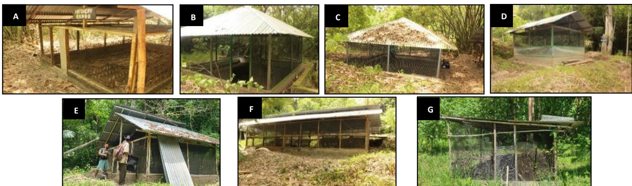
Figure 2 (A) Bamboo hatchery, (B) TN3 hatchery, (C) TN2 hatchery, (D) TN1 hatchery, (E) Fiper hatchery, (F) Florindus hatchery, (G) Emergency hatchery

The egg-hatching process in the hatchery was carried out semi-naturally using geothermal heat sources, and the burrows were created in soil with mixed texture. Hungayono has seven hatcheries located around the nesting sites, which have been managed since 2004 (Figure 2).