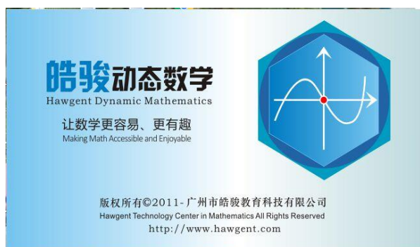
Figure 1. Hawgent Dynamic Mathematics Software