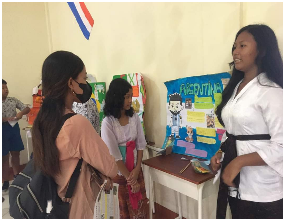
Figure 4. Examples of activities that implement cooperation values to build new knowledge regarding social science (Photo: Padmadewi, 2024).

In Figure 4, the school additionally facilitates socialization and orientation initiatives for the parents of students whenever a new policy is implemented, especially practicing Menyama Braya with students of different religions. The orientation for parents aims to ensure their comprehension of the values of Menyama Braya , particularly in relation to students of various religions, thereby enabling them to provide support for this initiative. Teachers, students, and parents participate in orientation meetings on a predetermined schedule, twice a semester. This meeting aims to harmonize the endeavors of educators, the anticipations of parents, and the objectives of the school in fostering the academic development of students and increasing parents' awareness about the school program, which includes the practices of Menyama Braya . In addition, during the meeting, parents have the opportunity to observe their children's activities at school first-hand, offering a tangible insight into their performance and behaviour in the educational environment. Educational institutions use this direct observation as a method to help parents gain a deeper understanding of their children's experiences and the pedagogical approaches used in the schools. The encapsulation of those strategies is presented in Table 5.