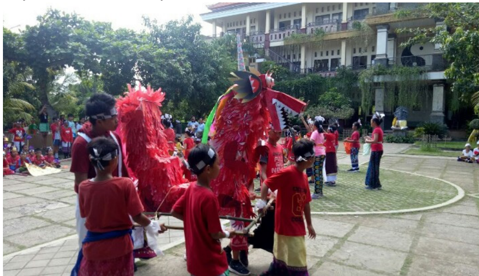
Figure 3. The implementation of equality values through empowering school and social culture, Barong Sai.

celebration of significant and religious days with students. From a sociocultural standpoint, these activities posit that students acquire experiences that foster a sense of joy and equality. Figure 3 presents examples of how to foster an empowering school culture alongside social cultural activities, and Menyama Braya is exercised naturally.