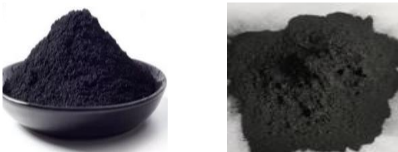
Figure 2. Activated Carbon Derived From Cocoa husk (CPHW)

The carbonization process was carried out to decompose the lignin and cellulose components into carbon. This was done by heating the charcoal samples in a furnace at a temperature of 400^\circ\text{C} for one hour. The activated carbon produced from the cocoa pod husk (CPHW) through this process is shown in Figure 2. The preparation of CPHW-based activated carbon involved two activation stages. The first stage, known as chemical activation, aimed to degrade organic molecules during the carbonization process. In this stage, potassium hydroxide (KOH) was used as the activating agent to enlarge the pore size, which increased with higher KOH concentration. The second stage, known as physical activation, was conducted to remove impurities remaining in the CPHW-based activated carbon and to promote the formation of new pore structures [5].