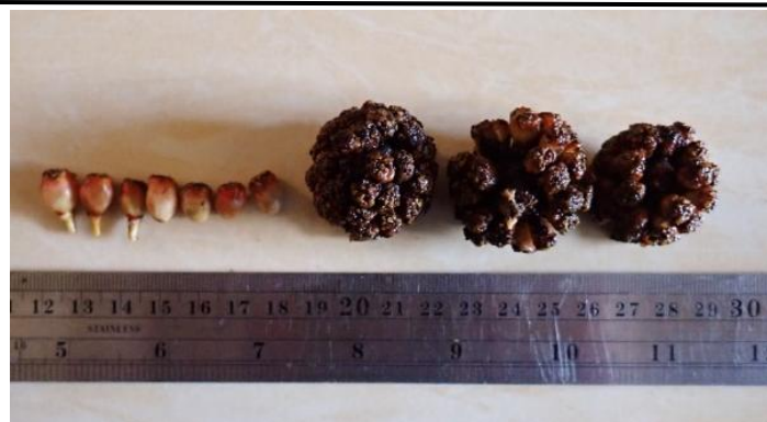
Figure 1. Ficus minahassae fruit

The extract obtained from maceration was brownish in color, the extract was concentrated using a rotary evaporator at a temperature of 40 °C and a concentrated extract of 30 grams was obtained. Evaporation was carried out using a rotary evaporator at a temperature of 40 °C to prevent damage to the compounds contained in the Ficus minahassae fruit.