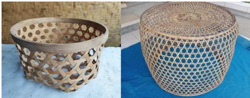
Figure 1. Iconic Products of Sidetapa Village

product variations such as decorative lamps, room partitions, and woven decorations (Figure 1). This diversification opens up opportunities for collaboration with interior designers and the hospitality industry, thereby increasing the competitiveness of local products and encouraging the growth of a community-based creative economy.