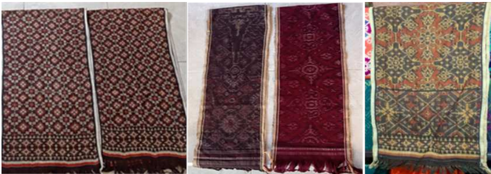
Figure 3. Iconic Products of Tenganan Village