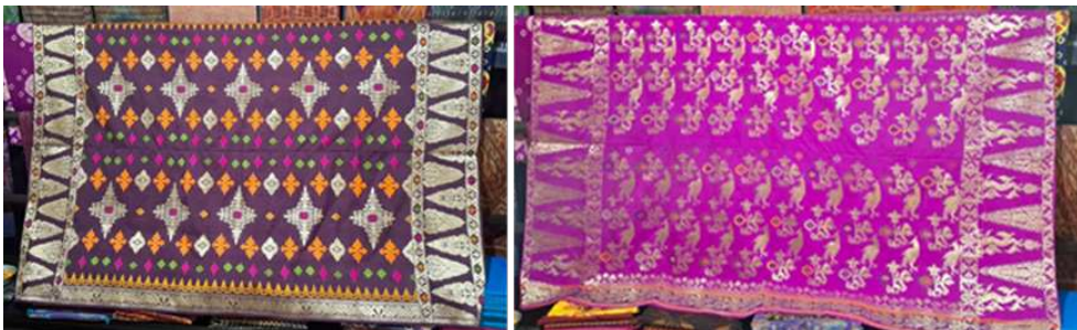
Figure 4. Iconic Products of Gelgel Village