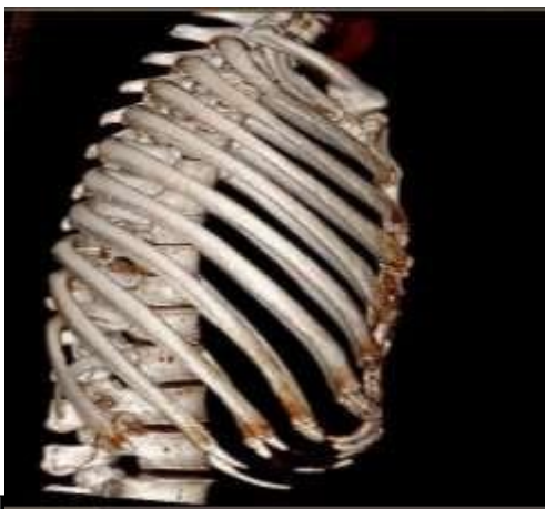
Figure 3. Initial chest computed tomography (CT) scan at two weeks showing no visible fracture line of the right posterior sixth and seventh ribs