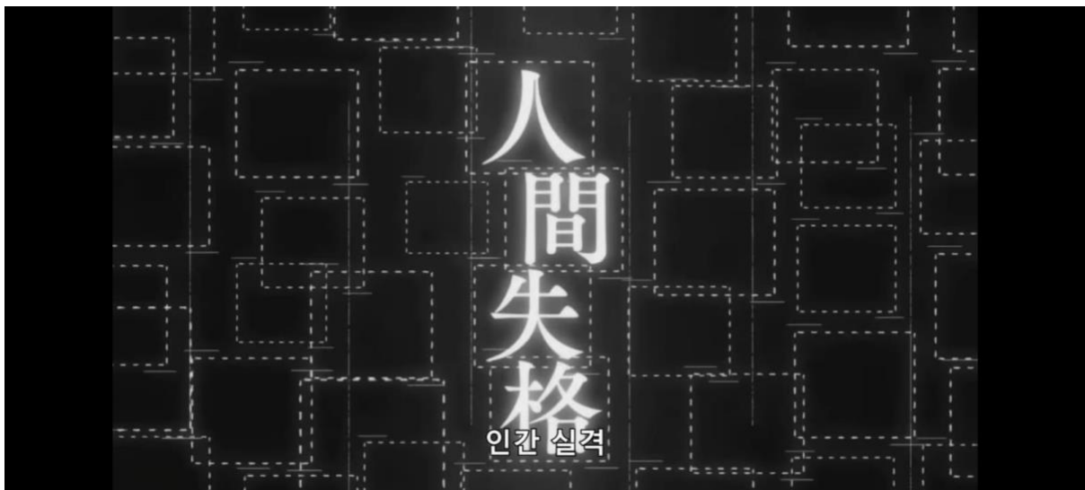
Picture 1 and 2. Dazai Osamu's ability introduction: No Longer Human (Bungou Stray Dogs S1 EP1 16:31)

When written vertically, the Japanese text is written from top to bottom, with multiple columns of text progressing from right to left. When written horizontally, the text is almost always written left to right, with multiple rows progressing downward, as in standard English text. As mentioned and shown above, the ability introduction uses the Kaisho kanji writing style. Kaisho or regular script, block lettering, or "square style" is a precise style of brush strokes that is based on the Chinese kaisho in form and function. It was strongly influenced by the Sui dynasty (581–618) and the Tang dynasty (618–907). Early examples of this style in Japan are mainly inscriptions on various statues and temples during the early Heian period (794-1185). Over time, there has been a movement in Japan to become more culturally independent, incorporating a Gyosho style to copy the Lotus Sutra. There was a second wave of influence during the Kamakura and Muromachi periods, which primarily used Zen-inspired techniques and were inspired by Zen priests.