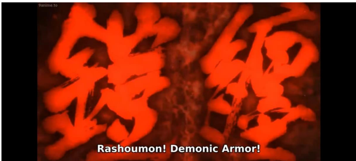
Picture 5, 6, and 7. Rashomon's special technique: Tenma (the second screenshot) Tengai (the third screenshot) (Bungou Stray Dogs S2 EP11 17:20)