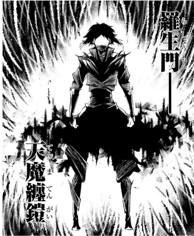
Picture 8. the original depiction of "Rashomon: tenma tengai" in the manga (Bungou Stray Dogs Manga Chapter 35 page 21, raw version)

In Bungo Stray Dogs, there's a compelling visual aspect that enhances the character's ability activation process is the typography of the kanji that appears whenever Akutagawa activates his "Rashomon" ability. The kanji's bold and stylized typography conveys the strength and intensity of the ability. Furthermore, the characters are written in a calligraphic style, emphasizing the show's Japanese cultural influence and enhancing the visual impact. The deep red color chosen for the kanji is also meaningful because it is commonly associated in Japanese culture with power and danger. This highlights even more how remarkable Akutagawa's ability is. Besides that, the typography gives the viewer a visual cue to recognize when Akutagawa's ability is being used.