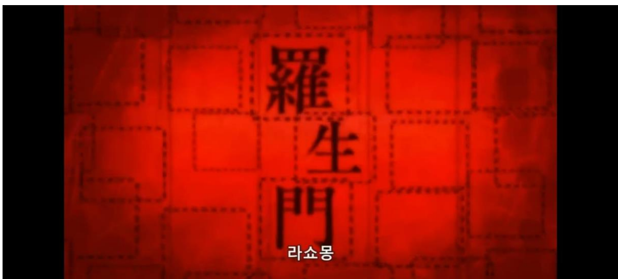
Picture 3 and 4. Akutagawa Ryunosuke's ability introduction: Rashomon (Bungou Stray Dogs S1 EP3 15:35)