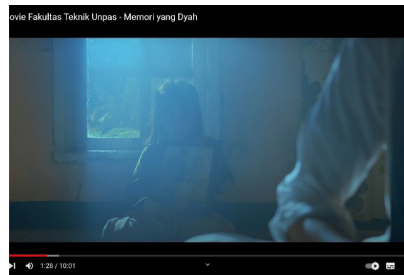
Figure 5. Scene in Memory yang Dyah by Irwan Jamal.

Irwan Jamal's short film is titled Memori yang Dyah , which was made with Yudha Mancha Prakarsa. Unlike the theater work, this one is a realism-style film. However, this does not mean that Irwan Jamal's artistic influence of post-impressionism does not enter into it. Some scenes emphasize symbols and meanings, instead of presenting reality. One of them is when there is a scene of a child holding a picture frame with dim lighting.