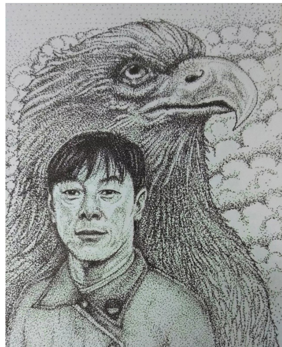
Figure 2. Painting of Shin Tae-yong and Garuda by Irwan Jamal.

Irwan's interest in interrogating and questioning is to open the door to an experience, to play with knowledge on the track of exploration. The ultimate goal of exploration is to find the most authentic and original in oneself.