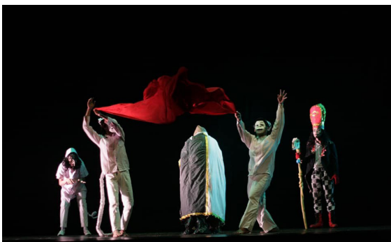
Figure 4. Staging style of Teater Piktorial by Irwan Jamal.

Irwan Jamal's theatrical works combine lighting, strict and contrasting coloring, and a choice of artistic forms that emphasize signification.