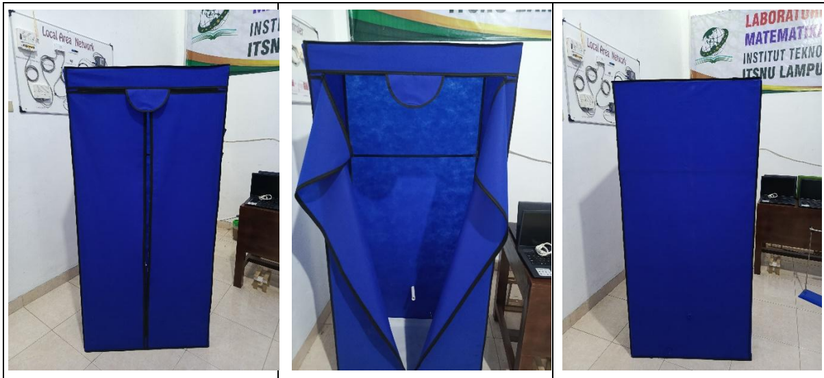
Figure 2. The assembly of a basic steam sauna apparatus