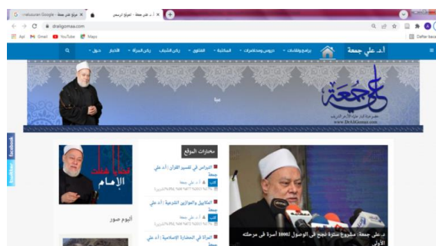
Figure 4. View of the draligomaa.com website