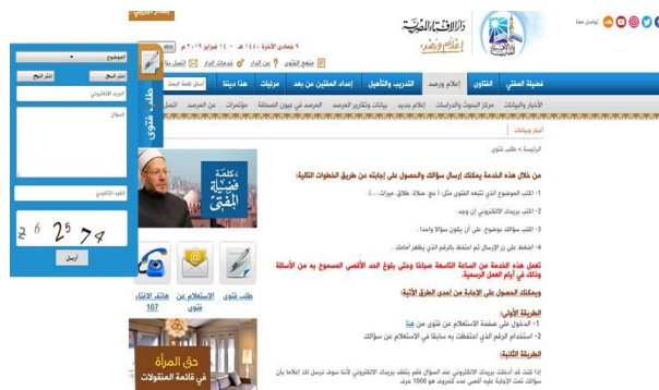
Figure 3. View of the dar-alifta.org web portal