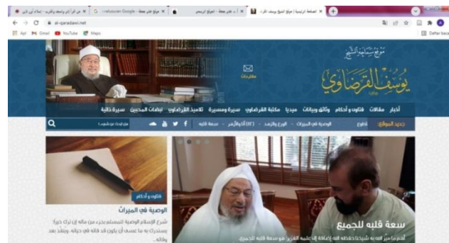
Figure 1. Appearance of the al-qaradawi.net website

Yusuf al-Qaradawi's website with the domain name al-qaradawi.net is the first personal website of an `alim in Arabic and English. The subjects of the al-qaradawi.net website revolve around Islamic law related to the topics of medicine, family, women and economy, democracy, terrorism and interfaith dialogue. The global Islamic community ( al-umma al-islamiyya alamiyya ) has always been the core issue that must be protected and maintained in this website. The visitors to al-qaradawi.net website have a option to contact al-Qaradawi directly to ask his opinion as mufti. Visitors can also view and call upon the fatwas that have been provided in the section entitled "Fatwas and Decisions" ( fatāwa wa-ahkām ).