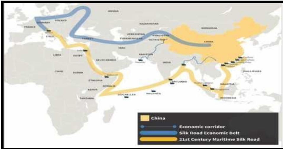
Figure 2. One Belt One Road Map

Indonesia was officially registered to join the OBOR on the arrival of President Joko Widodo at the One Belt One Road Summit (OBOR) which was held on May 14-15 2017 in Beijing. The conference was attended by 29 heads of state from 50 countries. In the meeting, Indonesia and China signed three cooperation documents namely in cooperation in the field of implementation of a comprehensive Indonesia-China strategic partnership in 2017-2021, then the signing of the Sino-Indonesian Economic and Technical Cooperation document, and the last signing of the Jakarta fast train project facilitation cooperation - Bandung. Indonesia through President Joko Widodo offered various mega projects in the infrastructure sector to China, including the development of the Kuala Tanjung Port in North Sumatra and the Bitung Port in North Sulawesi which is an international port. This collaboration between Indonesia and China continues until now, which has achieved various results in the project and investment.