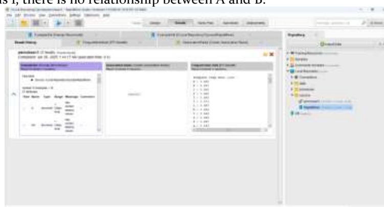
Figure 4. Results of Apriori Analysis (Continued)

The figure above shows information on support, confidence, lift, and conviction in the second figure 4. If the lift value is >1, the transactions have a positive relationship (A increases the likelihood of B occurring). If the lift value is 1, the transactions do not influence each other. If the lift value is <1, the transactions are negatively related (A decreases the likelihood of B occurring). As for the conviction value, the greater the conviction value, the stronger the causal relationship between A and B. If the conviction value is 1, there is no relationship between A and B.