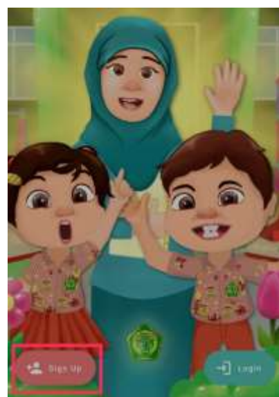
Fig. 2. Main Menu Interface