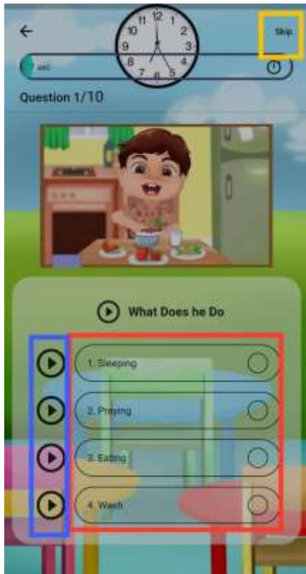
Fig. 3. Student Quiz Interface