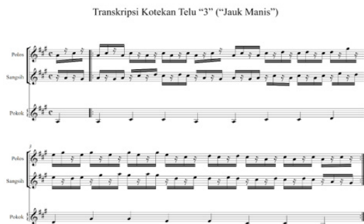
Figure 2. Kotekan Telu "Jauk Manis"