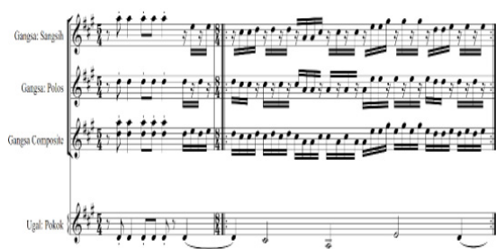
Figure 1. Score Norot Kotekan Transcription

focus, and teamwork among musicians. Each player must listen attentively to others, maintaining strict timing while complementing their counterparts, a practice that strengthens their musical skills and communal bond. This profound interplay of technical mastery and cultural philosophy ensures that kotekan remains a cornerstone of Balinese gamelan music, resonating with audiences both within Bali and worldwide.