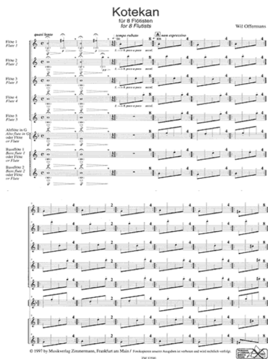
Figure 4 “ Kotekan ” Composition by Wil Offermans

The following represents the initial bars of the musical score created by Wil Offermans, entitled “ Kotekan .”: