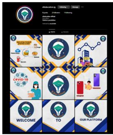
Figure 4. Instagram-Based Dissemination

During the dissemination phase, e-LKPD development was differentiated through media distribution products utilizing Instagram content (@efeducation.ig).