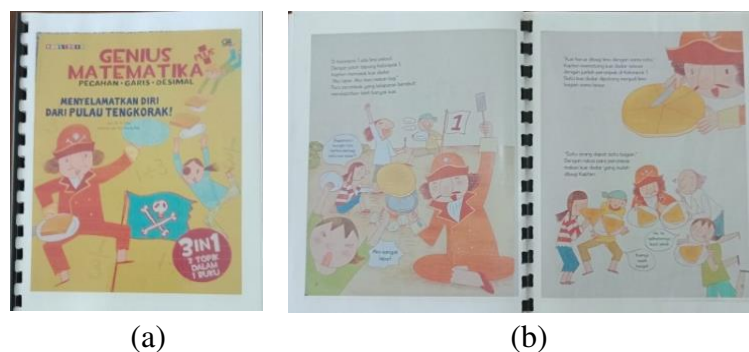
Figure 1. (a) a book Cover; (b) part of book content

In achieving the learning indicators and objectives, it is then designed to be a description of the learning activities that include teacher activities, students, and student response predictions accompanied by the anticipation of its didacticism. Learning activities are allocated to 2 meetings. At the first meeting, students are directed to: [5.2.1] redefine the meaning of fractions, and [5.2.2] explain the meaning of decimal fractions. The teaching materials used for the first meeting are the storybooks with the title “Menyelamatkan Diri dari Pulau Tengkorak (Escape from Skull Island)”, written by Okim Choi and published by PT. Gramedia Pustaka Utama Jakarta.