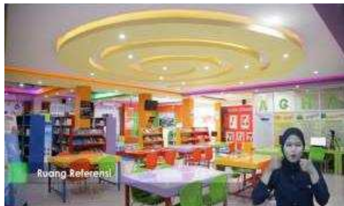
Figure 2. Reference Room