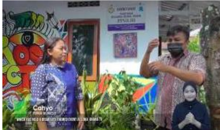
Figure 4. Programs at Loka Ghana library

activities of students to the surrounding community by delivering books. This shows the preferred meaning to the audience which is focused on showing the quality of the school library. In this case, the quality of the library is constructed by the video of Loka Ghana Library, so the meaning of the best school library is constructed from the video.