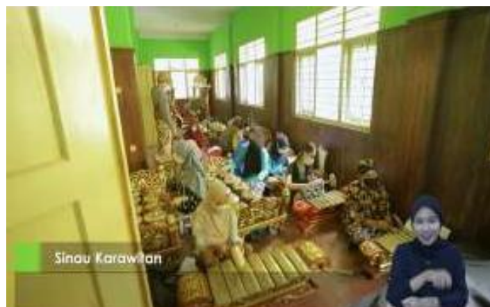
Figure 6. Sinau Karawitan activity

The library also constructs the show as a government appreciation through the display of remarks from several important figures around the Loka Ghana library, SMA Negeri 1 Sedayu is located,