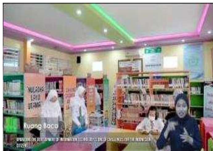
Figure 3. Reading Room

Not only the facilities in the library, this video also shows school activities and programs, such as UKS, religion, culture, agriculture, history, adhiwiyata environment, radio broadcasts and social literacy