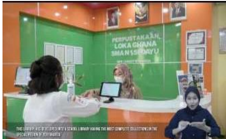
Figure 1. Circulation Services at Loka Ghana Library

Yogyakarta. This video displays various services and programs implemented by the Loka Ghana Library ranging from reading rooms, digital services, e-library loka ghana, digital and independent circulation services, library satisfaction surveys, online catalogs and attendance, reading oases, 3D facilities, reading booths, and reading corners spread throughout the school.