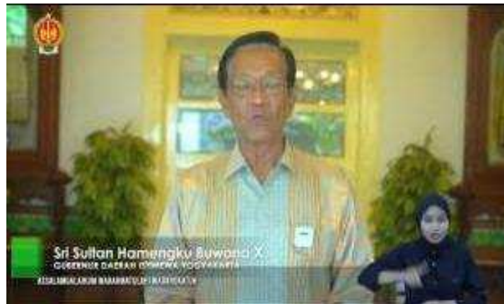
Figure 7. Speech and Welcome from Sri Sutan Hamengku Buwono X

such as the Governor of Yogyakarta, Regent, Members of Parliament, Regional Secretary (alumni of the Loka Ghana school) and others, as well as the surrounding community.