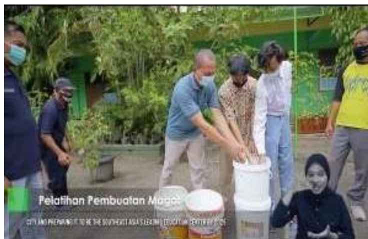
Figure 5. Maggot making training