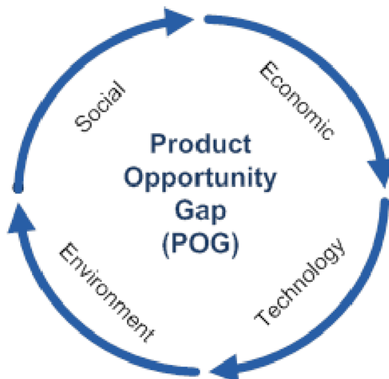
Figure 1. Scanning SETE Factors leads to POGs

between what is currently on the market and the possibility for new or significantly improved products that result from emerging trends (Cagan and Vogel, 2001).